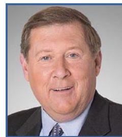
Mark Haines CNBC Anchor, posthumous