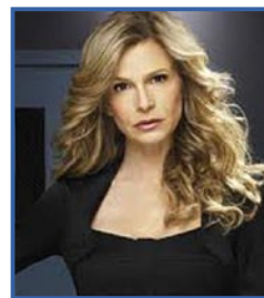
Kyra Sedgwick Actress, “The Closer” TNT