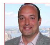
Emil Rensing Studio 3 Partners