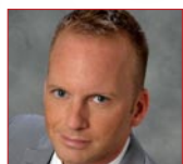
Raymond Dooley Sundance TV