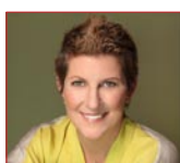
Tracy Powell A+E Networks